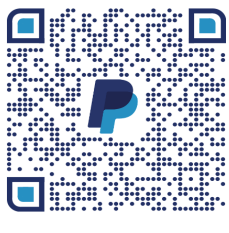
PayPal QR Link

Make Checks Payable to: District 11 A1 Lion Clubs