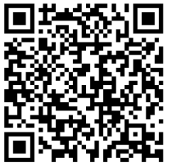
Registration Form QR Link

Registration Deadline on or before April 10, 2024